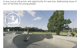
Shade Park A place for young people to come together. Family friendly and all ages. Equipped with opportunities to gather and socialize.