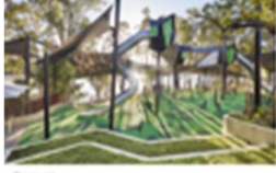
Assembly Point - Shelter