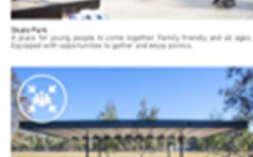
Shade Park A place for young people to come together. Family friendly and all ages. Equipped with opportunities to gather and socialize.