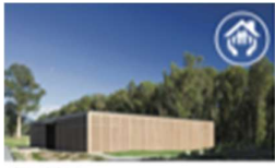
Community Centre For gathering, meeting, celebrating and for refuge in case of future threats