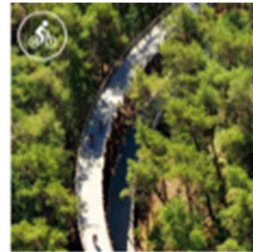
Bike Path A new connection between parts of the community. A new trail to support the summer months. A way to connect to neighboring areas.