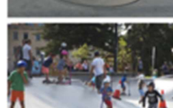
Shade Park A place for young people to come together. Family friendly and all ages. Equipped with opportunities to gather and socialize.