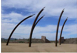
Memorial Park On the lake level to mark something of a personal tribute, not only for those that lost lives for the survivors, sharing thoughts, beautiful memories, or to give their respective names to the past and to the possibilities of the future. More than just a signpost and a wall, Memorial Park is a place for people to connect and share their experiences.